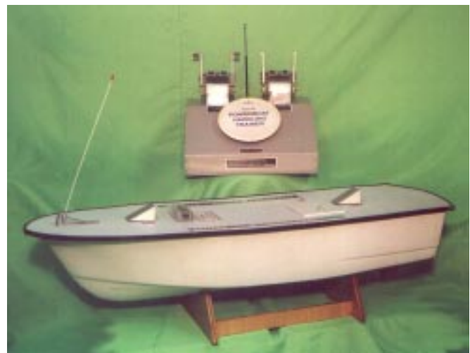
View of powerboat and control station

The boat is supplied with a cradle used when a battery in the boat requires recharging. Boat should