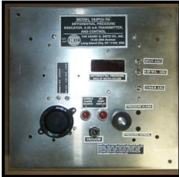
Model 192 PDI-TN

The Model 192PDI-TN is the result of our experience in manufacturing pressurization monitors, dating back to 1947 when we supplied GE Hanford Atomic Plant with our Model 120 Electronic Low Differential Pressure Indicator and Control to prevent deadly hydrogen fluoride from escaping from an area used in manufacturing atomic bombs. The Model 192PDI-TN can be installed in the wall and will withstand mild liquid cleaning. It has a stainless steel panel with a waterproof high audio output alarm. A threaded disc is supplied with a rubber gasket for the reference pressure opening, which when reversed should prevent cleaning fluid from entering the monitor. It has a pressure/vacuum range of 0-0.5" water column with a resolution of 0.001" water column.